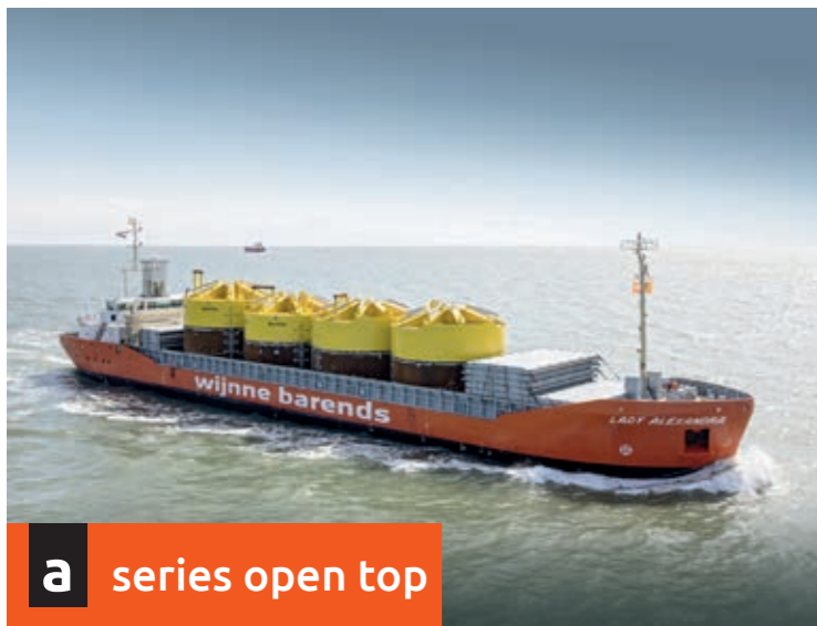
a series open top